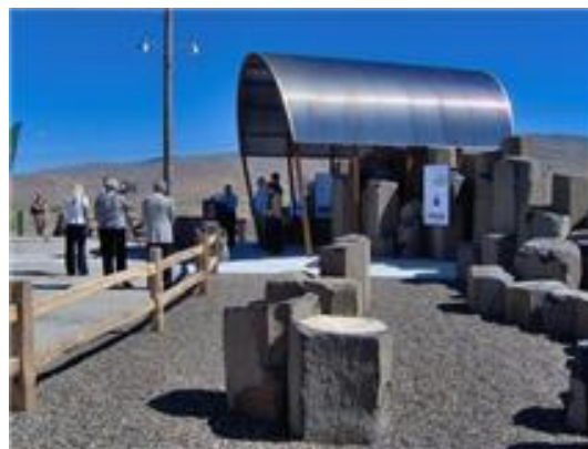
from the recent dedication of the Ada County Oregon Trail Interpretative Center