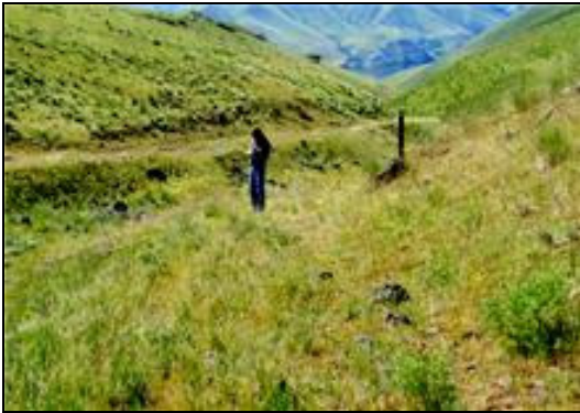
Katy Coddington on the Zig-Zag trail, Road Canyon, Brownlee Reservoir lower background

Over the weekend of June 18-20, about 35 people from several states met in Baker, Oregon, part of the time at the National Oregon Trail Interpretive Center and participated in a Goodale workshop and trail-tour activities. The tours, all day on the eastern part of Goodale's Cutoff on Friday and a half day on Saturday, followed the trail nearer the trail center and allowed participants to experience the remaining trail remnants.