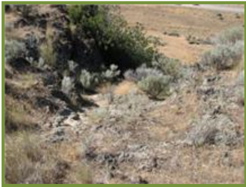
Ramp down the cliff by the new Ada County Oregon Trail Interpretive Center

As the emigrants climbed a hill southeast of Boise, they were rewarded with a view of the Boise River valley. From this hill, now called Bonneville Point, the Oregon Trail descended several miles across a number of benches until reaching the Boise River. The last descent was down a steep natural break in the basalt cliff. This route is visible after a short hike from the Ada County Oregon Trail Interpretive Center and Trailhead. Although not difficult compared to many of the stretches encountered thus far on the trail, I wonder how these brave pioneers could lock their wheels and slide down the hill, then barely mention the event in their diaries.