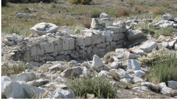
An old foundation at the Toano townsite

It was great to see so many friends at the convention. The Idaho chapter was well-represented with about 20 members present.