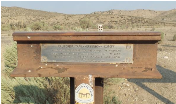
Start of Greenhorn Cutoff

At the California Trail Center, we stopped to look across the Humboldt to where the Hastings Cutoff exited South Fork Canyon. The Trail then continues through Carlin Canyon, which we were to visit on the return journey. While the river was very low for our visit it did in the past occasionally fill Carlin Canyon and an alternative route known as Greenhorn Alternate was taken.