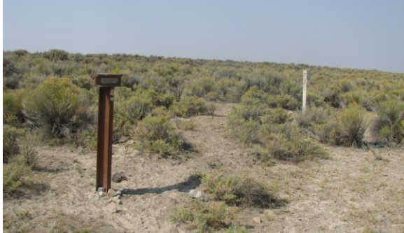
California Trail heading from the Humboldt springs to the west

It was great to see so many friends at the convention. The Idaho chapter was well-represented with about 20 members present.