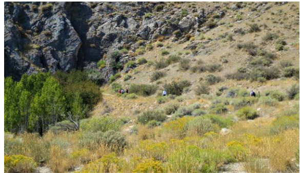
Cave Creek Trail approaching the Rock Shelter

We returned to the NWR for lunch and many then took the short hike to Cave Creek where a natural water source springs from a hole in a cave at the base of the Ruby Mts.