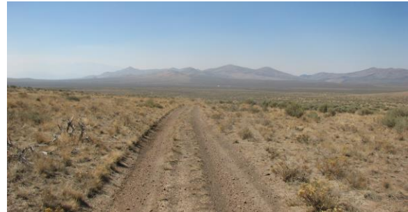
California Trail near the Humboldt Divide

Trail north of Wells, Nevada, as it traveled over the Humboldt Divide.