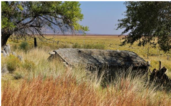
Spring House at Fort Ruby sits on damp ground close to a Spring and was used as cold storage for supplemental foods

We were given a brief introduction at the Refuge to the NWR and the history of the valley and then continued south to the site of Fort Ruby. The Fort was built here in 1862 to protect the Overland Trail from the Utah border to Austin in mid-Nevada which crossed the southern end of Ruby Valley.