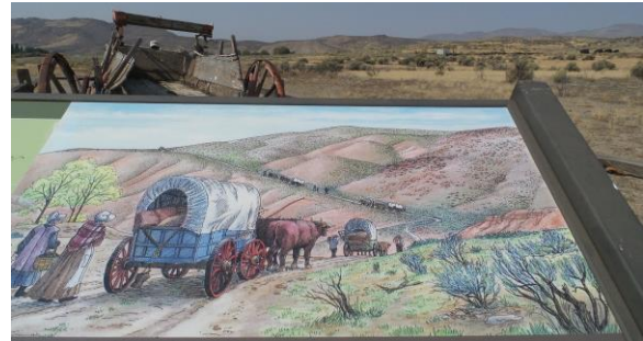
Interpretive Board with Emigrant Pass in the background

We made two stops in the old railroad town of Carlin. The first was just to the SW, on State Route 278, where the California Trail ascended a 'considerable hill' now known as Emigrant Pass.