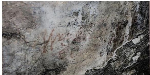
Settler signatures on the wall of the Cave.

The cave was used by Native Americans, pioneers on the Hastings Cutoff and soldiers, many of whom left their 'marks' on the walls and ceilings of the rock shelter.