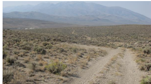
Humboldt route of California Trail heading towards the Humboldt Wells (springs) in the valley below

It turned out to be a great section of trail with beautiful scenery, a number of pronghorns, and impressive ruts.