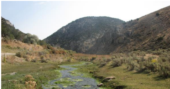
Bishop Creek Canyon on the Bishop Creek route of the California Trail