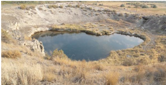
The 'Hot Hole' at Elko

First stop was Les Schwab in order to quell the continuous alarm associated with uneven tire pressure! Soon, thereafter we stopped at the 'now diminished' Elko Hot Hole.