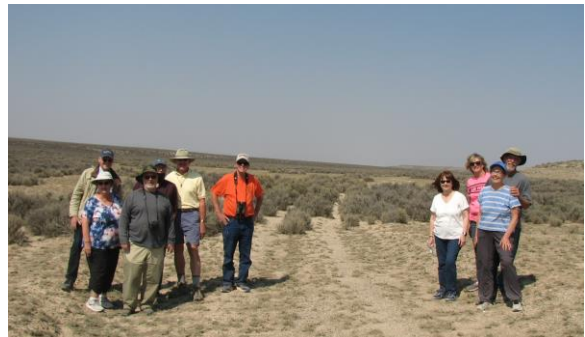
Ten brave souls who followed me on the Toano Road (tracks through the middle of the picture)

Friday was the day to drive home. For the last few years I have wanted to explore the Toano Road from northeast of Wells to the Snake River at Salmon Falls Creek. The Toano Road was a freight road from the transcontinental railroad to Boise. Because I was as close to the old railroad town of Toano as I was going to be for some time, I decided to lead a tour of the Toano Road that day. Ten people chose to follow me into the unknown Nevada desert on roads I had never traveled before. Brave people!