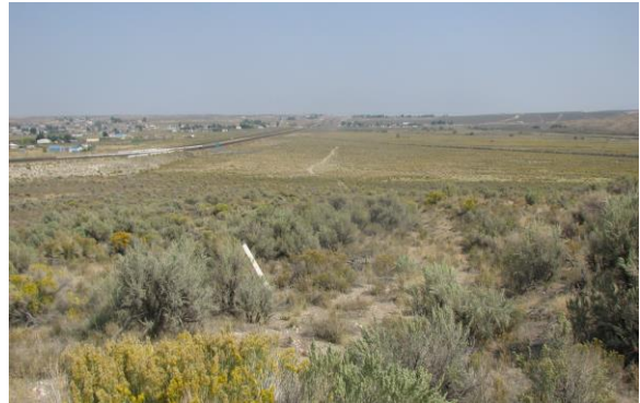
California Trail just a few miles east of Elko. Note I-80 on the left of the photo.

It was fun to explore parts of the California Trail and the Toano Road which I had never seen before.