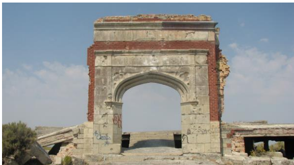
Arch of the Metropolis school building

We explored Bishop Creek Canyon and visited the old townsite of Metropolis, a 1910's ghost town which started with grand ideas of a new town and dried up when they lost their access to water.